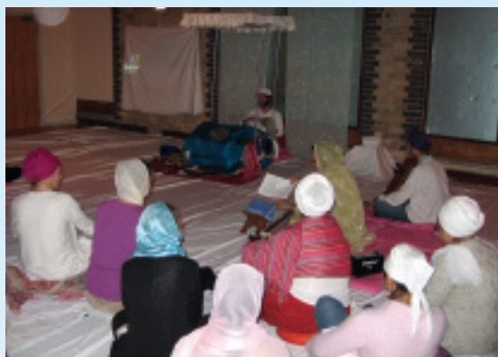
GRDP Keertan programme